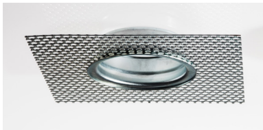
750+PCZ Trimless Kit Front fitting, full skim