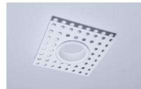
Installation kit for overlap flange Springs attached to fixture