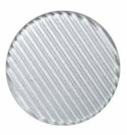
Linear Spread Lens

Accessories Order Code: Louvre/Lens L145 Honeycomb Louvre